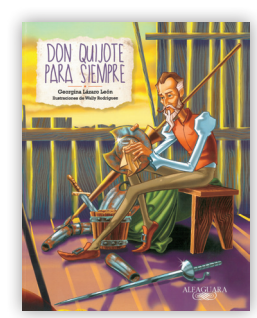
Don Quijote para siempre