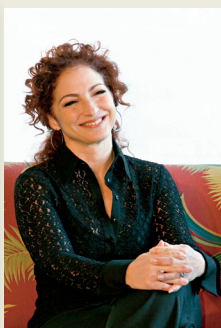
Gloria Estefan, cantante.