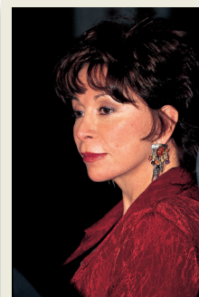
Isabel Allende, escritora.