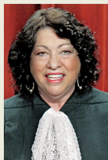
Sonia Sotomayor, jueza.