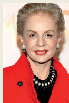
Carolina Herrera, diseñadora.